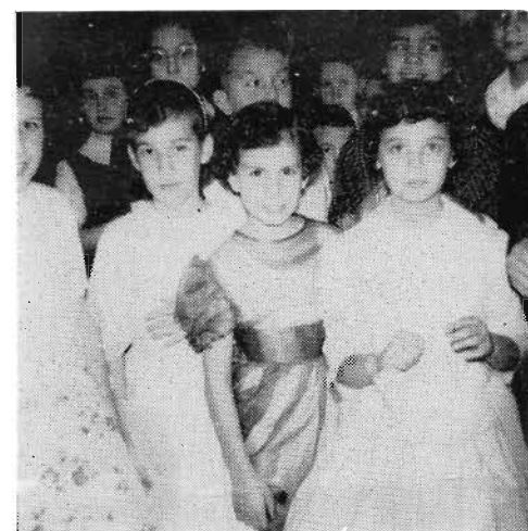
Dallas Student Affiliate

were held on Sunday afternoon every second month.